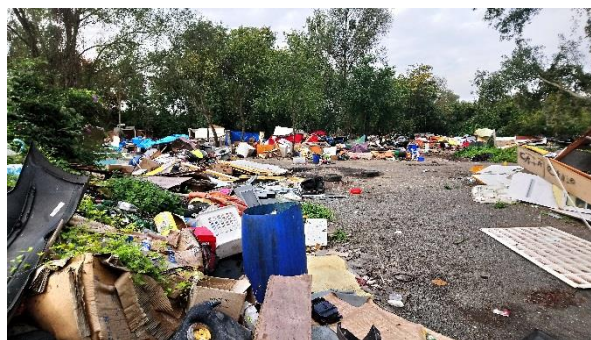
Unlawful dumping of waste